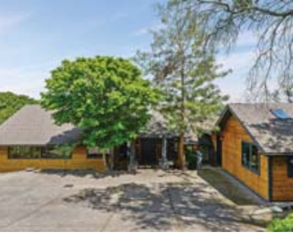
649 Sky Ranch Court, Lafayette

649SkyRanchCourt.com $1,845,000 5 Beds | 4.5 Baths | 3015± Sq. Ft. | .71± Acre Lot