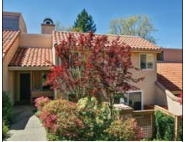
207 Paseo Bernal, Moraga

207PaseoBernal.com $895,000 3 Beds | 2 Baths | 2044± Sq. Ft.