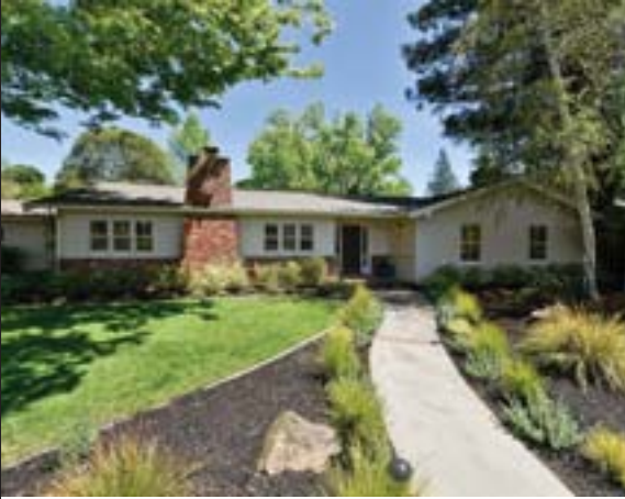
556 Arrowhead Drive, Lafayette

556ArrowheadDrive.com $1,795,000 4 Beds | 3 Baths | 2584± Sq. Ft. | .24± Acre Lot